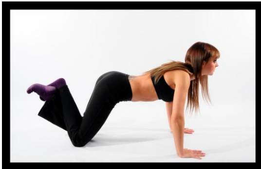
Upper Body- box press up (girls)

Aerobic training will enable you to ski longer, as fatigue results in poor concentration ending in injury from crashing.