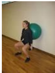
Standing leg exercises