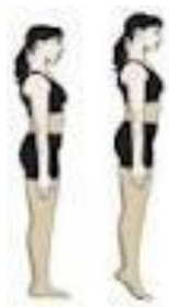
Calf Raises- strengthen lower leg muscles