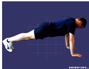
Upper Body- Press up (boys)